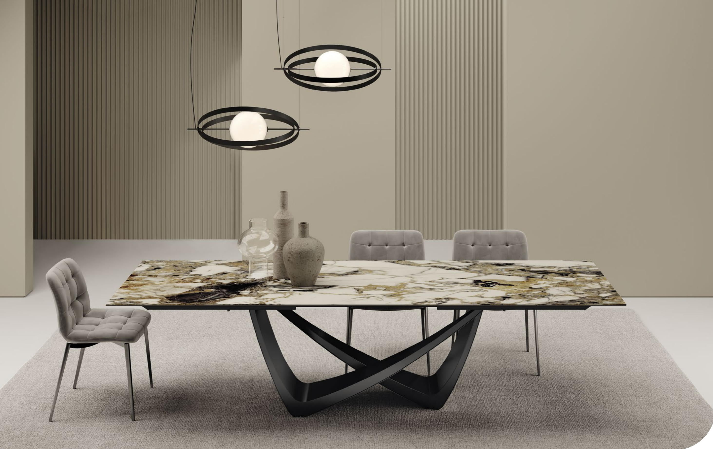
[In questa immagine] Bach tavolo cod. 53.85 struttura M055, piano CM010 | Kuga sedia cod. 40.38 struttura M326, rivestimento TEBQ018 | Papillon lampada cod. 56.54 struttura M055