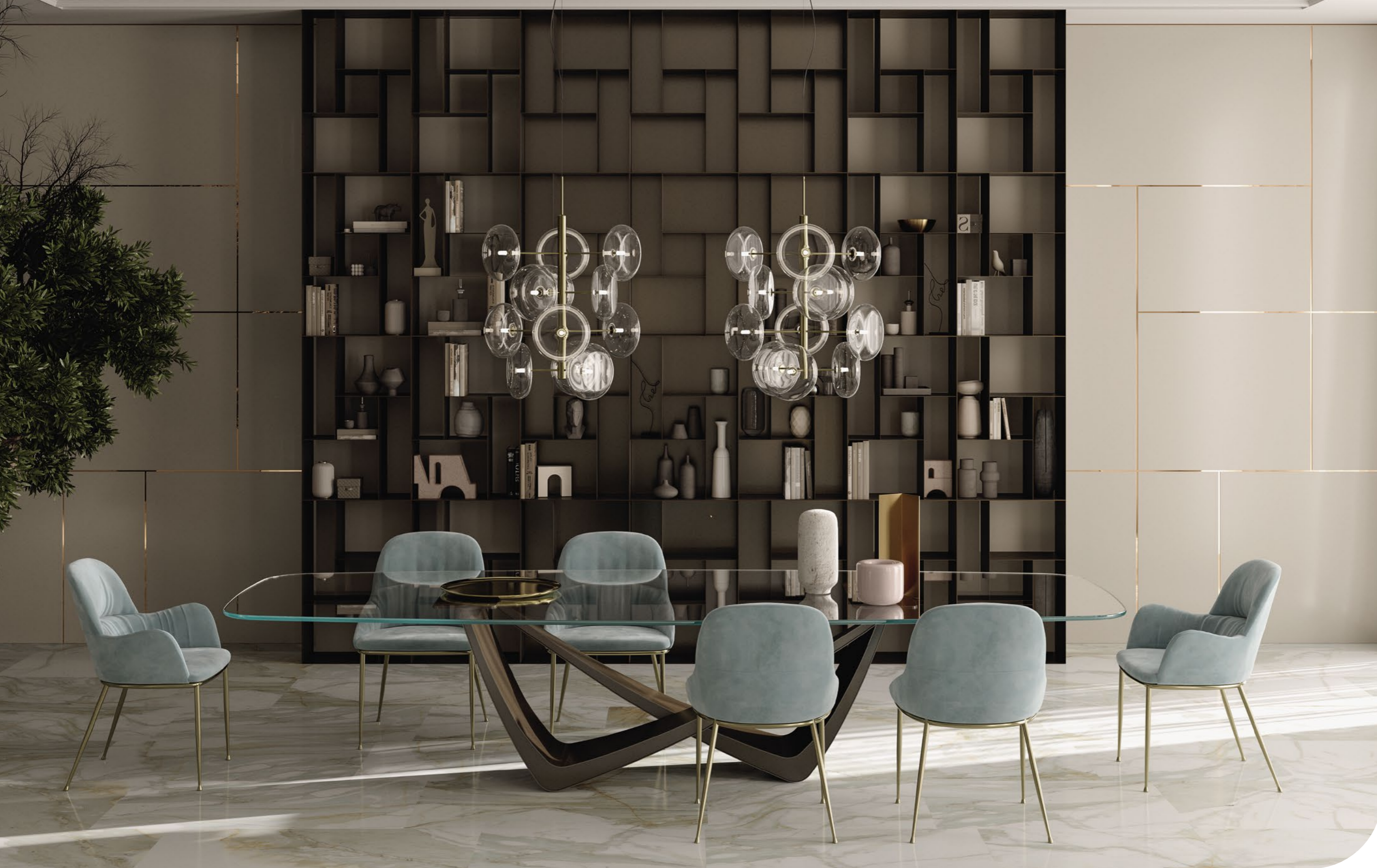
[in questa immagine] Bach tavolo cod. 53.78 struttura M028, piano C157 | Queen sedia cod. 34.46 struttura M328, rivestimento TENO008 | Queen sedia cod. 34.47 struttura M328, rivestimento TENO008 | Spark lampada cod. 56.37 rosone e struttura M352, vetri V001 | Atena libreria 16 moduli cod. 16.31 struttura M028, Atena libreria 12 moduli cod. 16.32 struttura M028, schiena M028