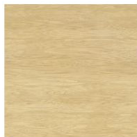
Veneered wood Natural ash

You can find the complete collection of Bonaldo fabrics and leathers on the website https://www.bonaldo.biz/