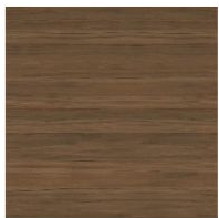
Veneered wood Walnut Canaletto