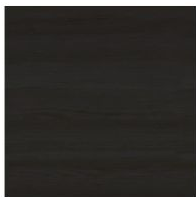
Veneered wood Coal ash